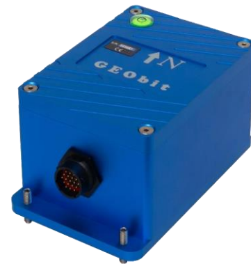
GEO fb a200

The GEO fb a200 (C-type) is a very low-noise triaxial force-balance accelerometer with a large dynamic range, suitable for seismology, hazard mitigation and civil engineering applications. The instrument has both a flat response to ground acceleration from DC to 200 Hz and a stable phase response within the passband. Output range is 40V pp differentially and supports variety range of gain sets from +/-4g to +/-0.25g in the standard configuration and availability for higher gain set under request. Due to its high dynamic range which exceeds 155dB, the sensor provides from on-scale recording of earthquake motions to structural seismic noise monitoring and allows engineers to study motions at higher frequencies. The sensor allows easy field calibration through its calibration line. Inside the GEO fb a200 there are three similar accelerometers, orthogonally placed. The sensor is operating according to the force-balance principle as closed-loop sensor (servo accelerometer). The motion of the seismic mass is monitored from a very sensitive capacitive transducer and a very low noise VHF preamplifier. The demodulator generates in-phase and low noise seismic signal which is fed back to the seismic mass through a phase compensator, a power amplifier and a fully symmetrical force actuator consisting of a double coil magnet system. This design eliminates any non-linearity due to lack of symmetry. The output amplifier sets the selectable acceleration gain between +/- 4g to +/-0.25g.